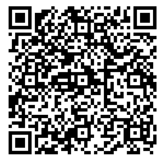
Figure 1: QR Code to Access Sustainability Guide