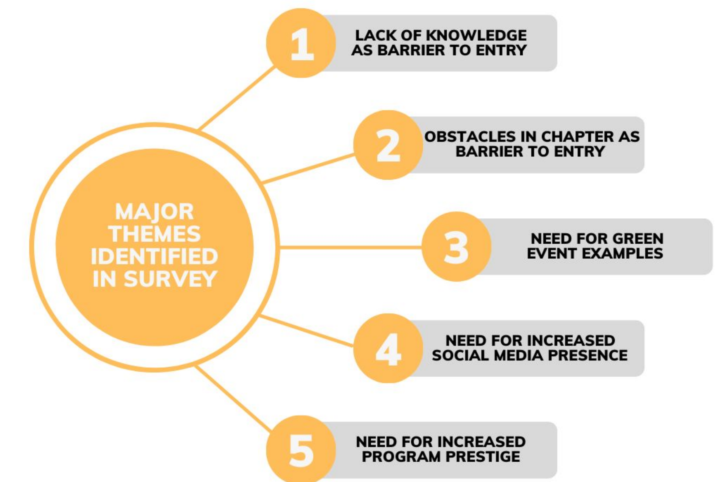
Figure 4: Major Themes Identified in GGG Feedback Survey