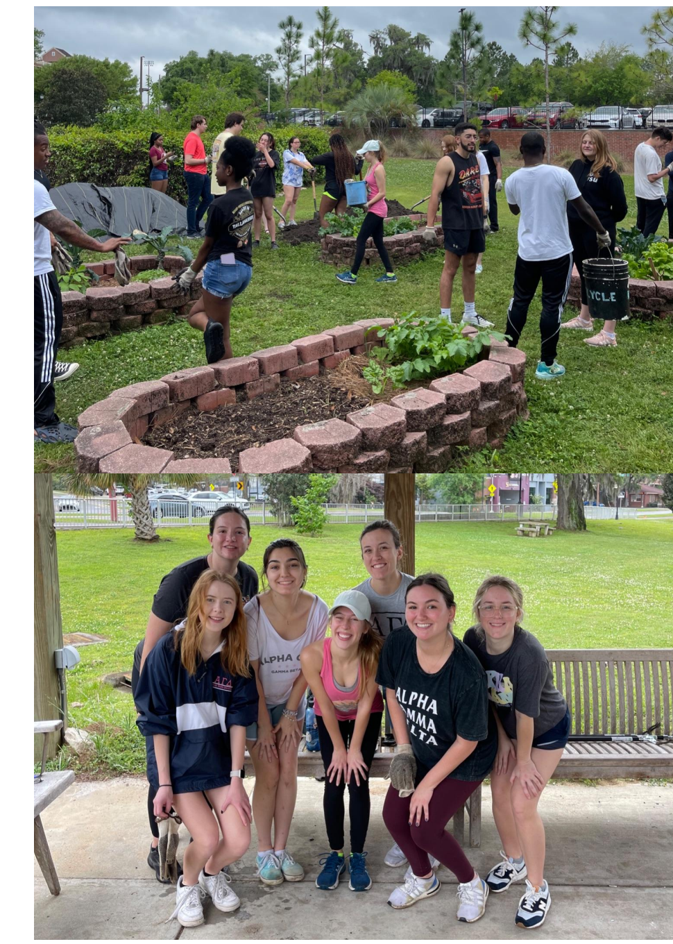
Figure 3: Photos from GGG Garden Volunteering Event